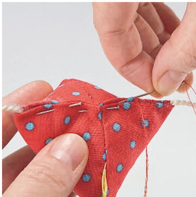
Sew in legs