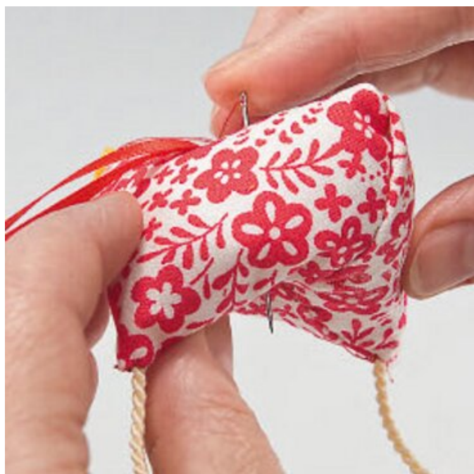
Hanging tape and sew in shape

For the beak check ribbon is folded in half and placed diagonally into the fabric folded to the right.