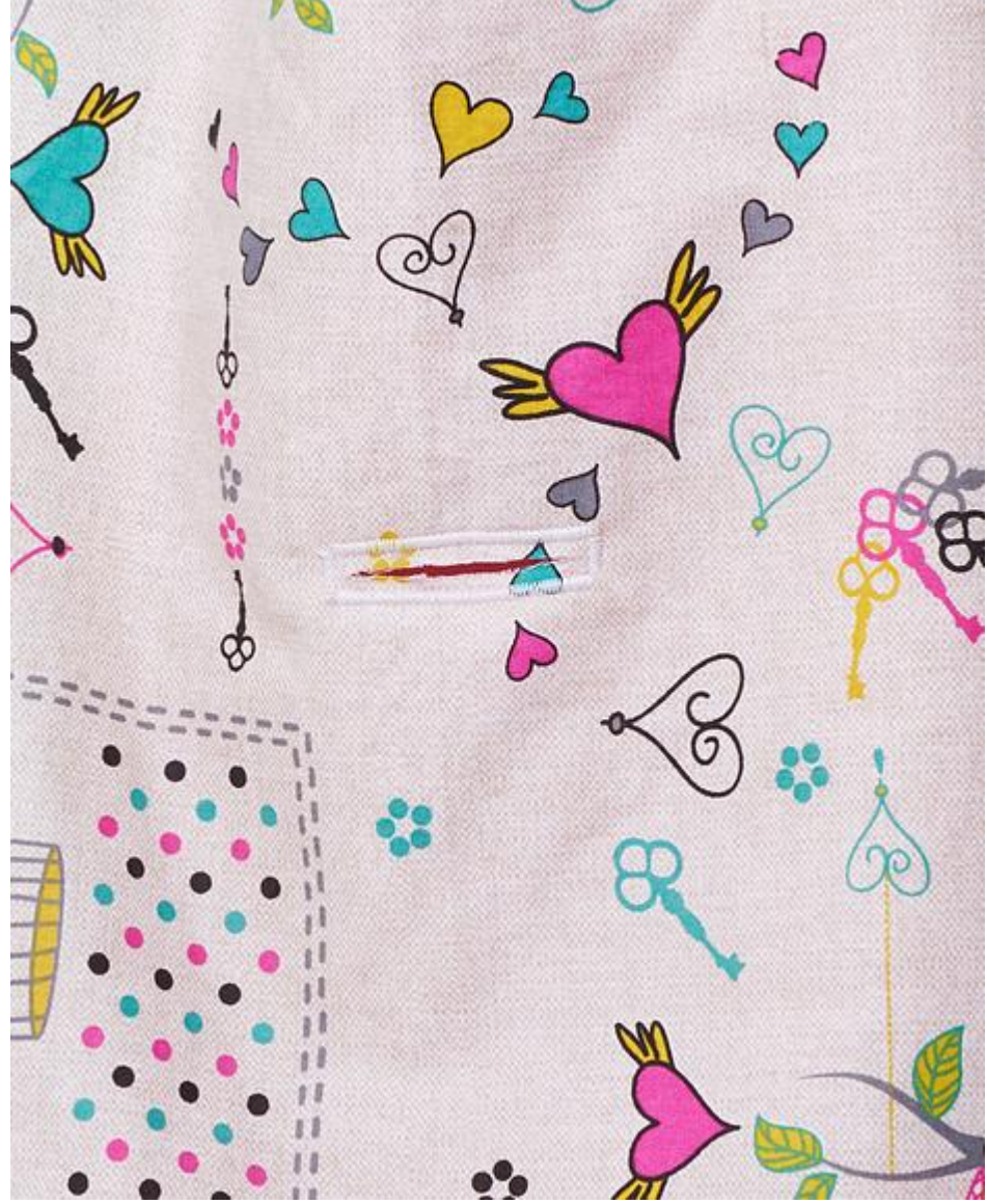
Belt slot for the baby car seat On Pattern there is a marking for the belt slot. This is transferred to the back of the finished blanket and is made like a buttonhole: sewed around with a zigzag stitch and finally carefully cut in.