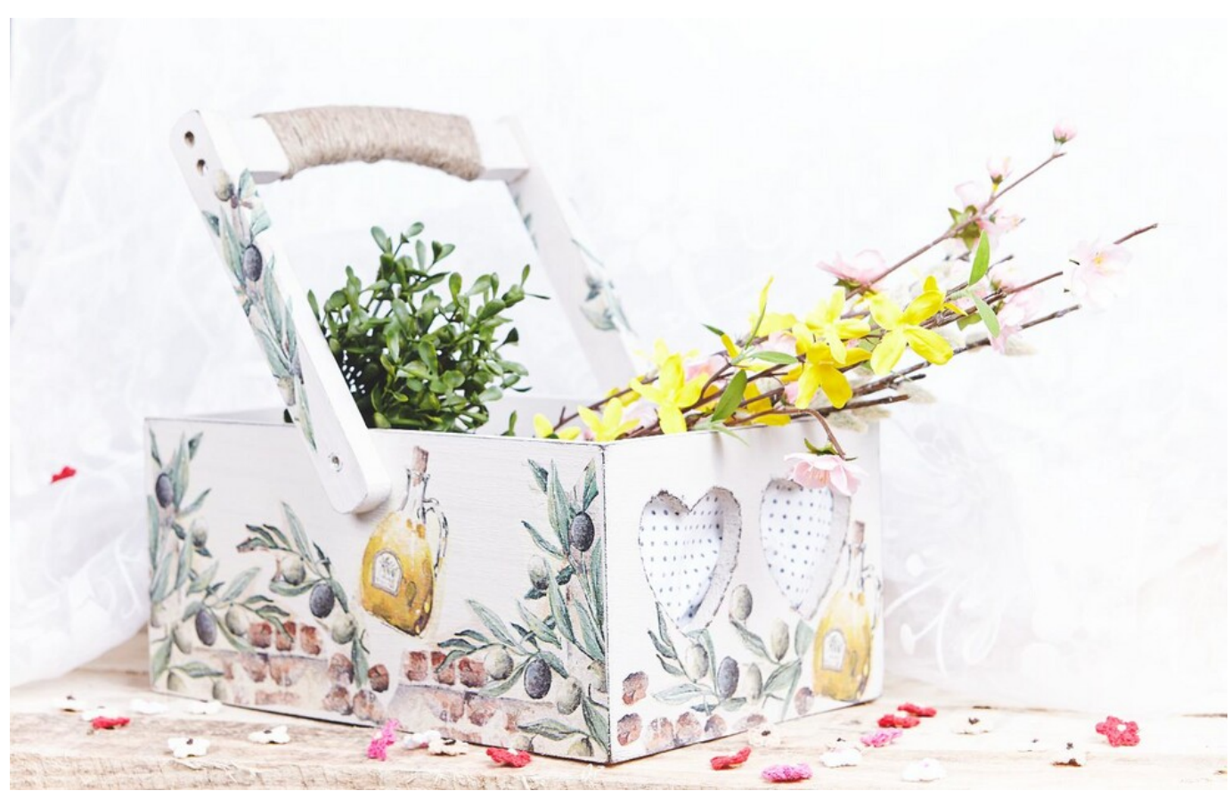
This basket is a successful example of the extraordinary effect of Napkin technique:. With its pretty olive motif it is not only practical but fits optically in the kitchen, in the entrance area as well as on the terrace.