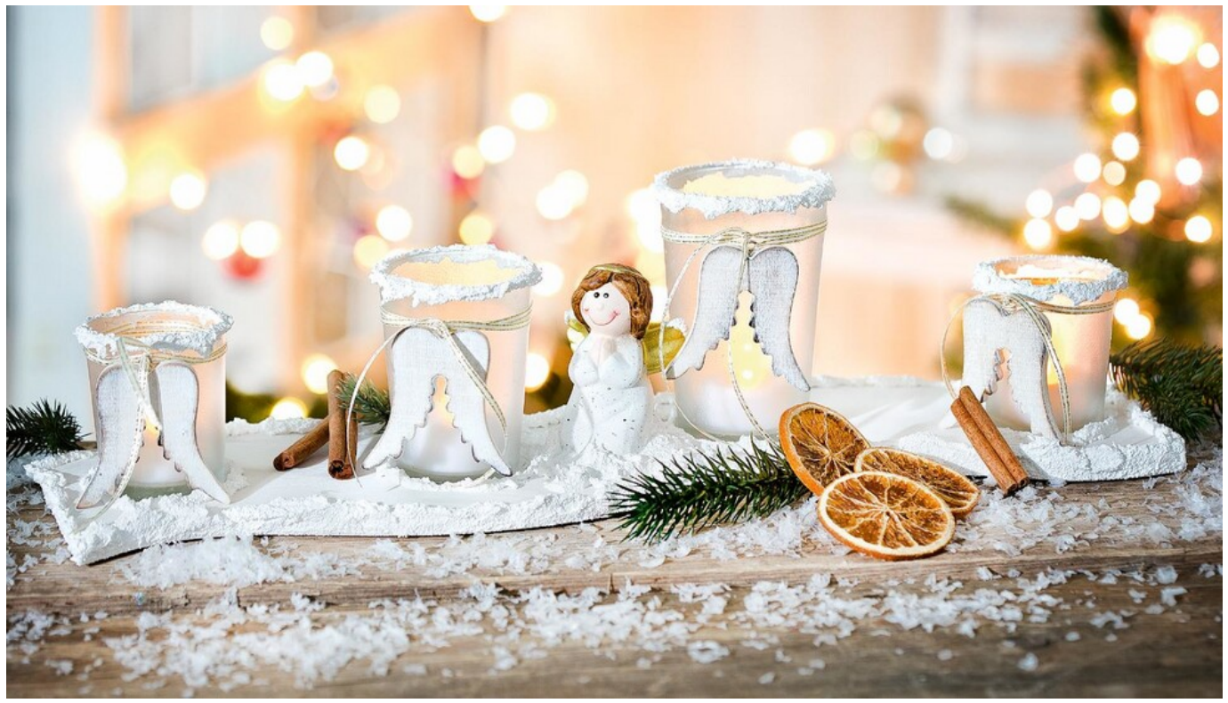
Conjure up a heavenly glow with this snow decoration for Christmas and winter time! The instructions describe how you can make the angel tea light glasses yourself with little effort.