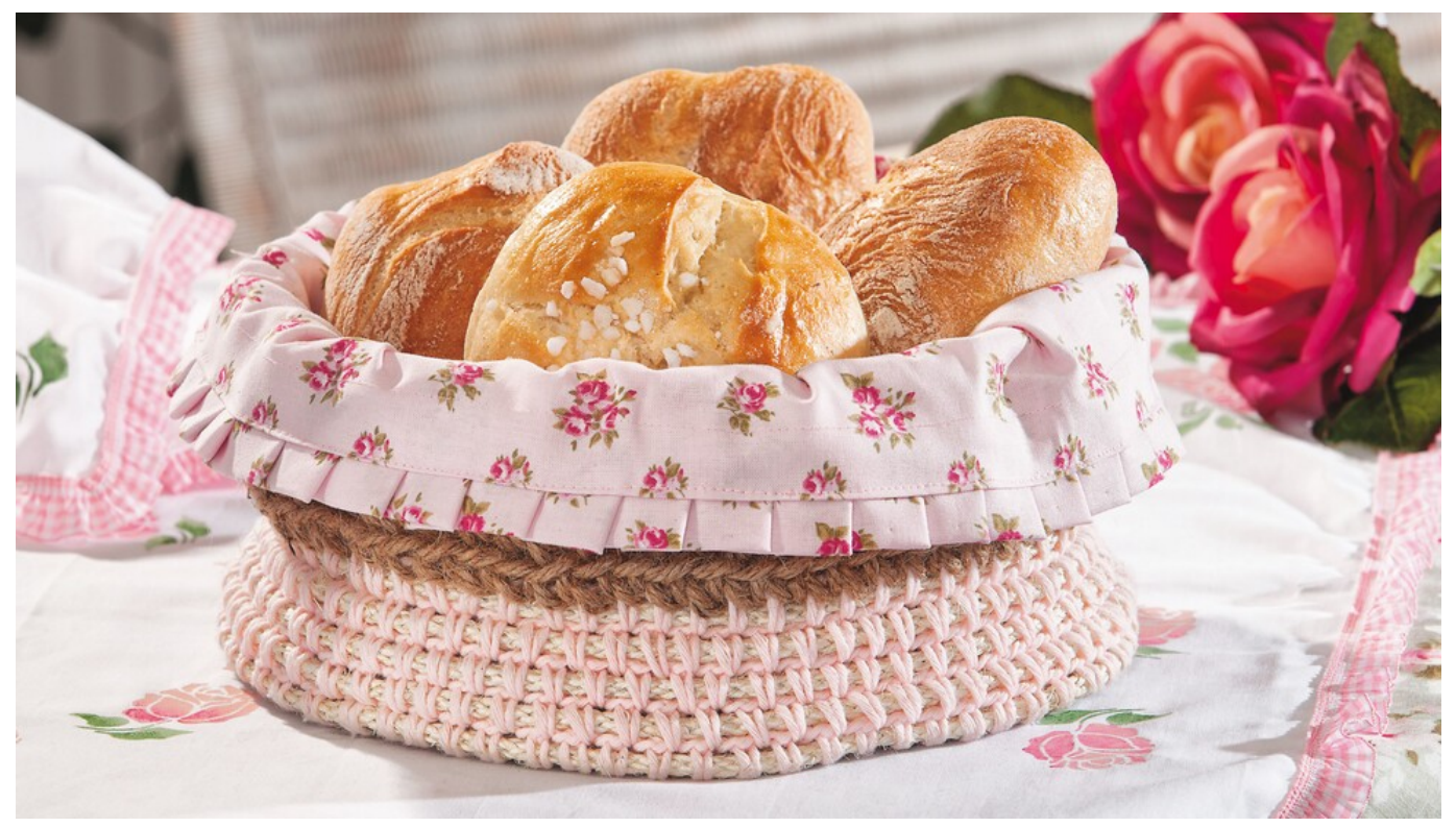
Here's how it works

This bread basket in country house style is made of coarse Jute yarn crochet and gets its stability from figure wire. With an inlay of romantic rose fabric it will decorate every breakfast table.