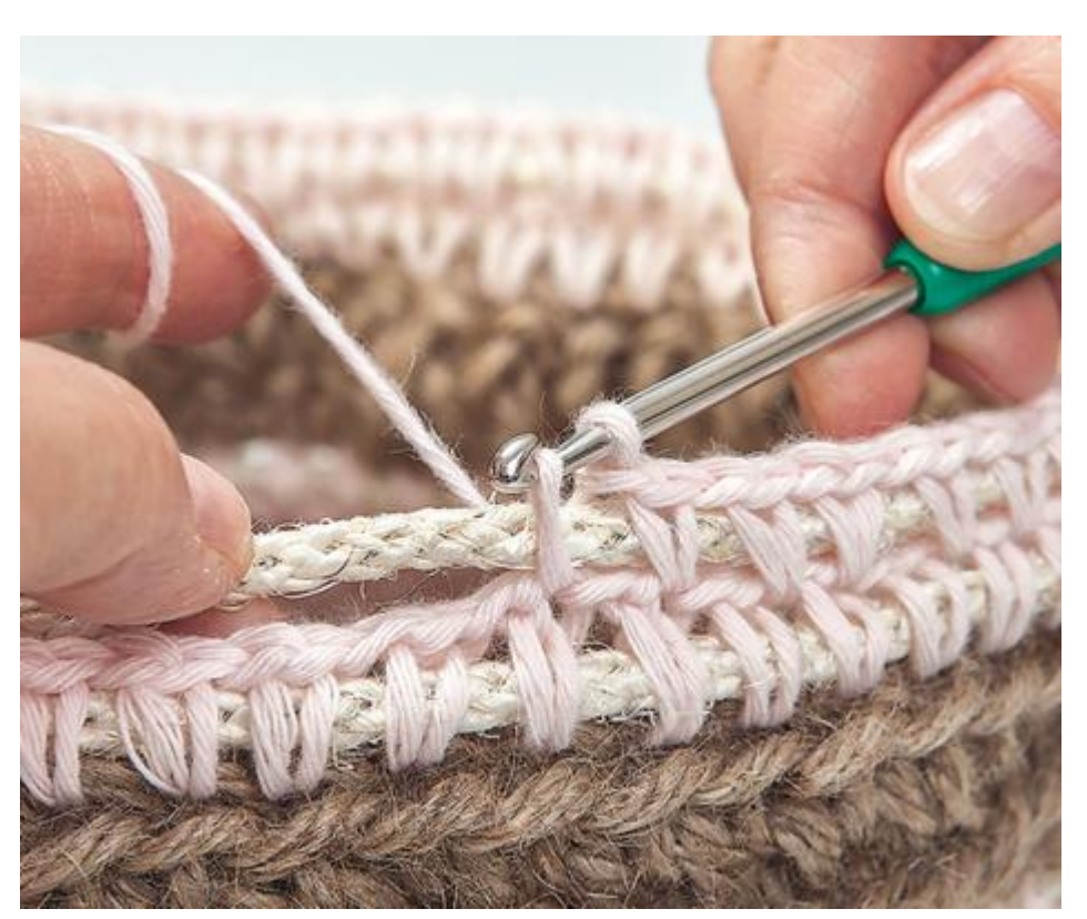
By crocheting figure wire into the side edges the basket gets its strength.

Dear sewer, as fabrics are seasonal goods and we always want to have trendy fabrics in stock for you, it can happen that the sewn fabric is no longer in our range.