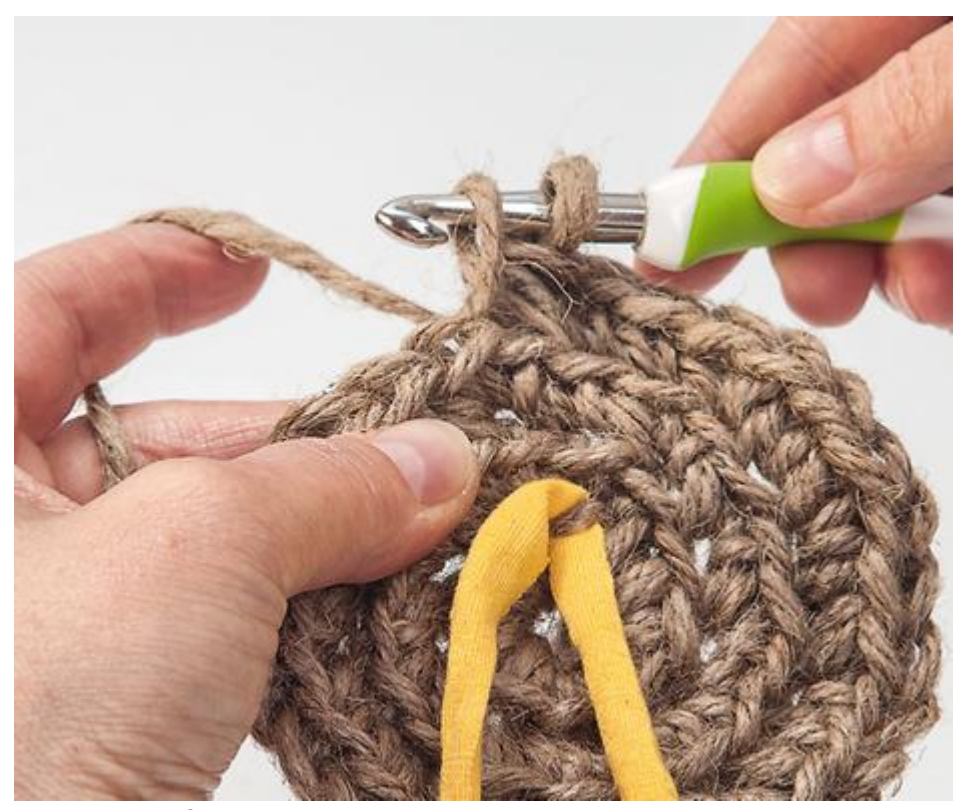
The bottom of the crochet basket is crocheted in rounds.