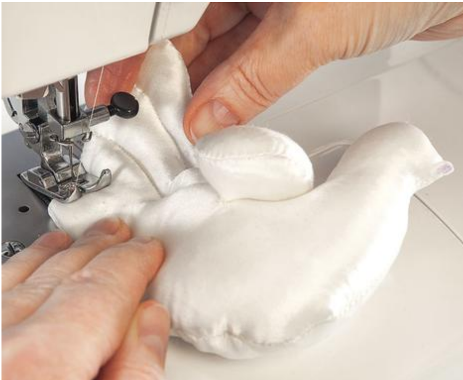
Stitch the wings and tail tip of the finished stuffed and sewn pigeon with topstitching.