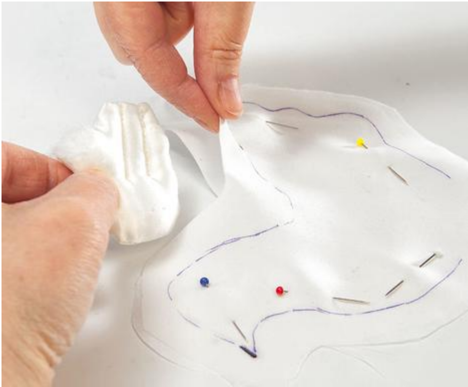
Fabric cuts of the silk pigeon sew together on the left side, turn it over, stuff it with filling cotton wool.