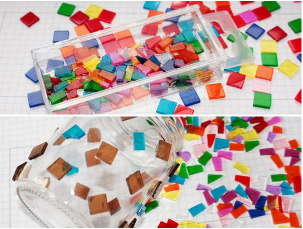
Step 3: Attach the Strips

Another creative option is to cut the mosaic pieces with scissors or pliers and use the fragments for your design. Be especially careful not to injure yourself with the hot glue , as the surface of the fragments is smaller.