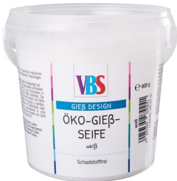
VBS Eco pouring soap, White, 600 g