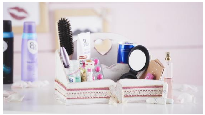
Lovingly designed and filled