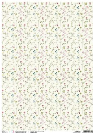
Motif straw silk "Flower Shop - Delights Garden"