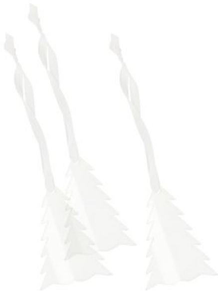
Acrylic Decorationpendant "Christmas tree" with ribbon, set of 3