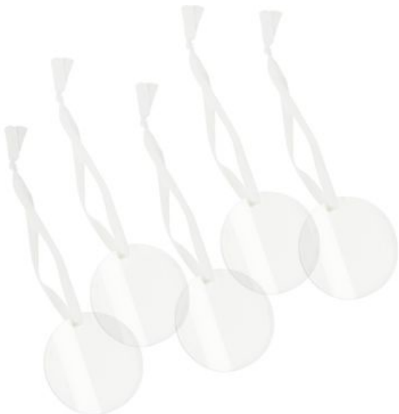
Acrylic Decorationpendant "Round" with ribbon, set of 5