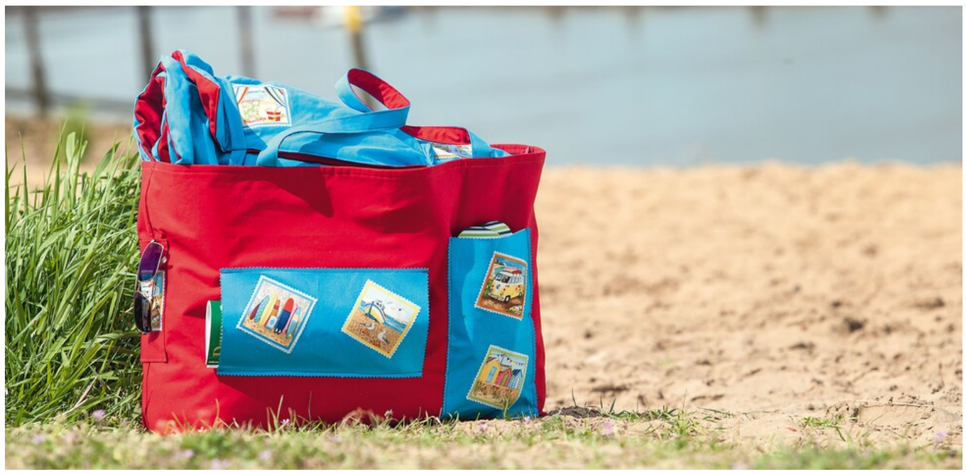
And this is how you do it

In this large bag there is room for everything you need for a trip to the bathing lake, even the large self sewn beach sheet. Especially practical are the small patch pockets that keep glasses, flip-flops, magazines and the like handy.