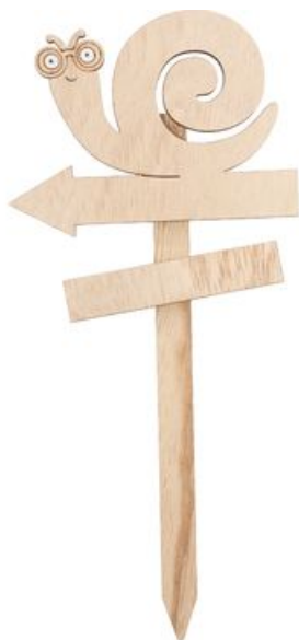
VBS Wooden plug "Snail Pepper"