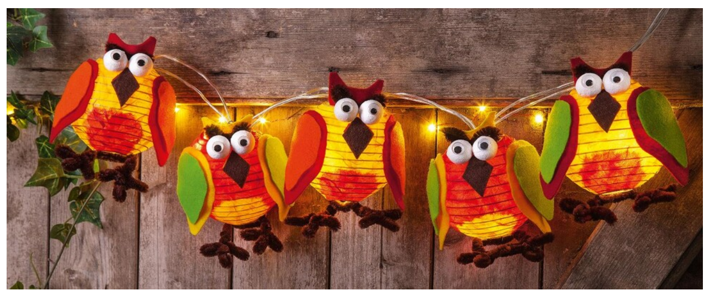
A funny owl light chain of lampshades for your home.