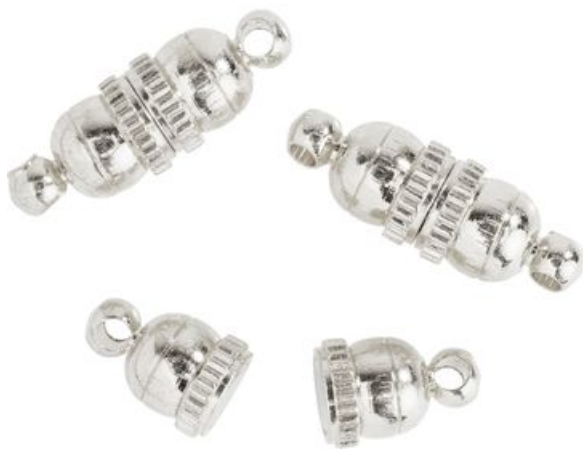
Magnetic closure, "Cup" silver