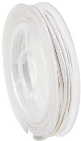
Jewellery cord, 5 m x 1 mm, White