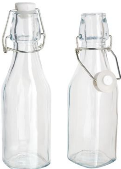
VBS Glass bottles with swing top 2 pieces