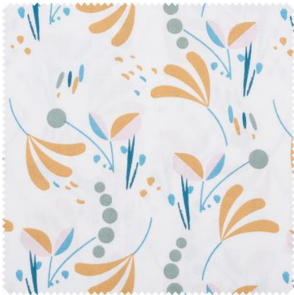
Cotton fabric "Lorena" Howel Amber