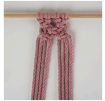
Row 7 - 8 = Horizontal rib knots