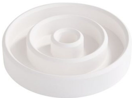
Silicone casting mould "Stick candle holder Chic"