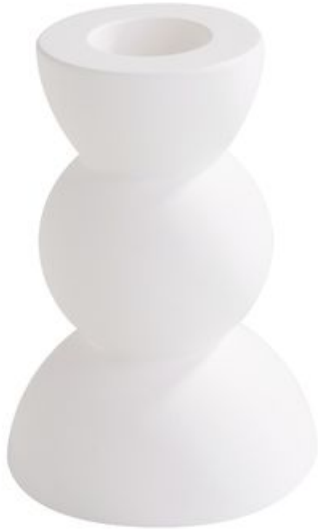
Silicone casting mould "Stick candle holder Fun"