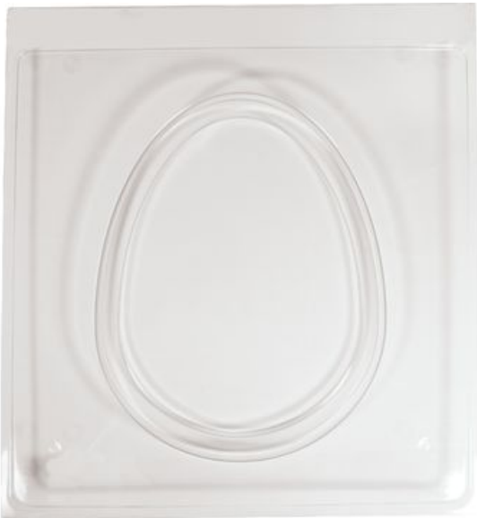
Casting mould "Decoration plate egg shape"