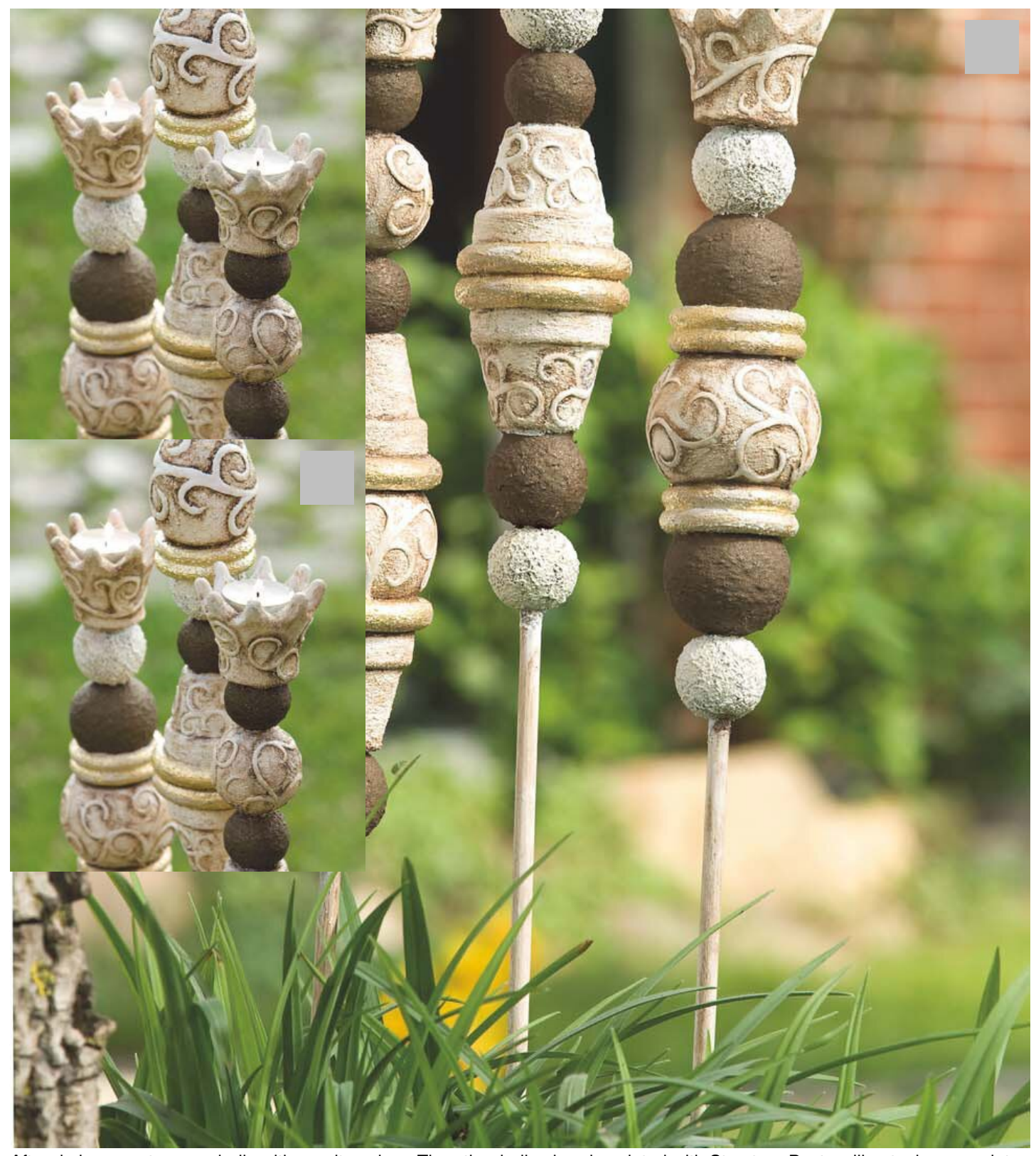
After drying, create some balls with granite colour. The other balls already painted with Structure Paste will get a brown paint. With Leaf metal you set golden accents on the wooden rings

Finally, patinate the remaining elements and the wooden sticks. Apply a base coat of white Outdorr Color paint and let it dry. For the Patina mix paint in Antique Red with Black and white and dilute this mixture with water. Apply the paint with a brush and wipe it off with a dry cloth and then with a damp sponge.