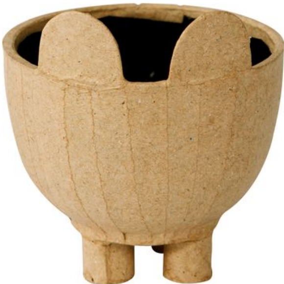
Flowerpot "Fipsi", waterproof