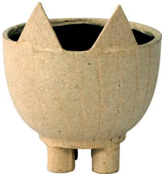
Flowerpot "Tapsi", waterproof