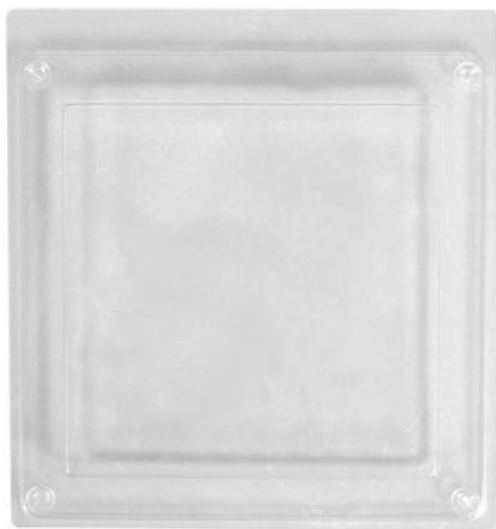
Casting mould "Tile", 11 x 11 cm