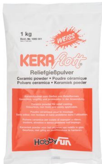
Keraflott Relief Casting Compound, White, 1 kg