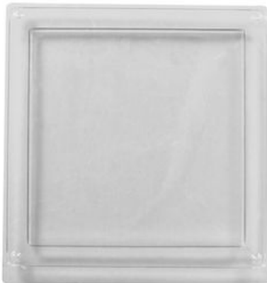
Casting mould "Tile", 16 x 16 cm