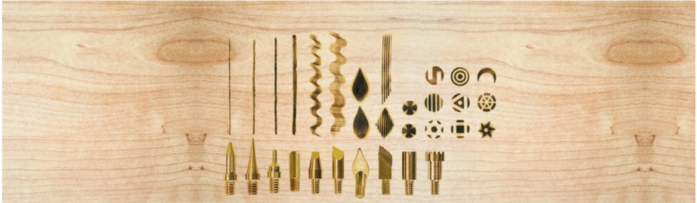
All products for handicraft technology Wooden burning at a glance