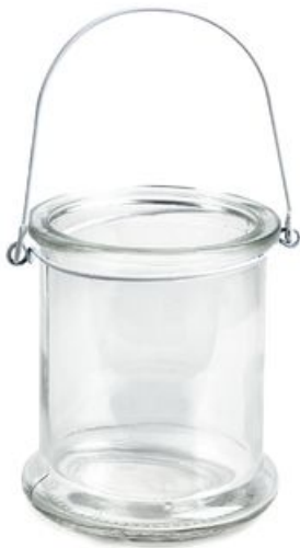
VBS Glass lantern with metal bracket