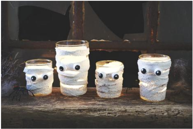
Last-Minute Halloween Ideas