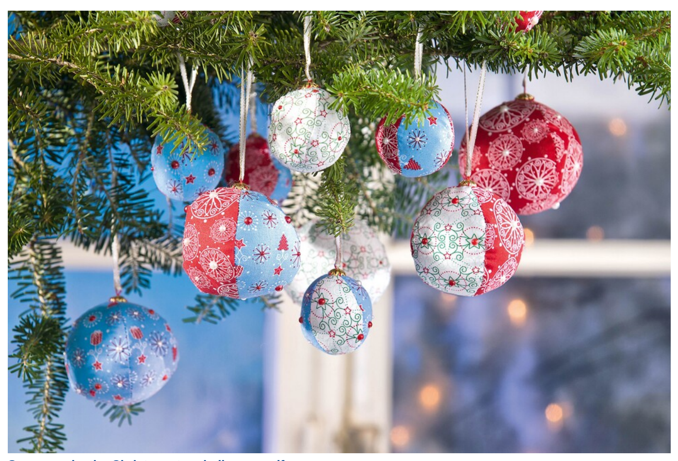
So you make the Christmas tree balls yourself

The most beautiful christmas tree balls are definitely the self-designed ones. The sewn baubles are made of christmassy fabric cuts. Your tree decoration becomes a very special creative highlight. To make the pretty fabric balls for your Christmas tree, download the motif template.