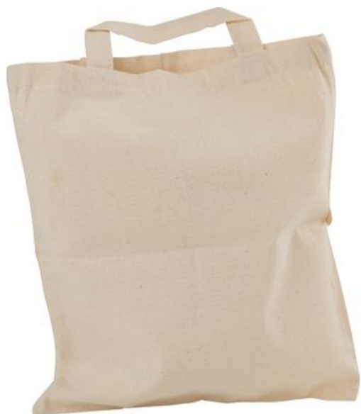
VBS Cotton bag, 42 x 38 cm