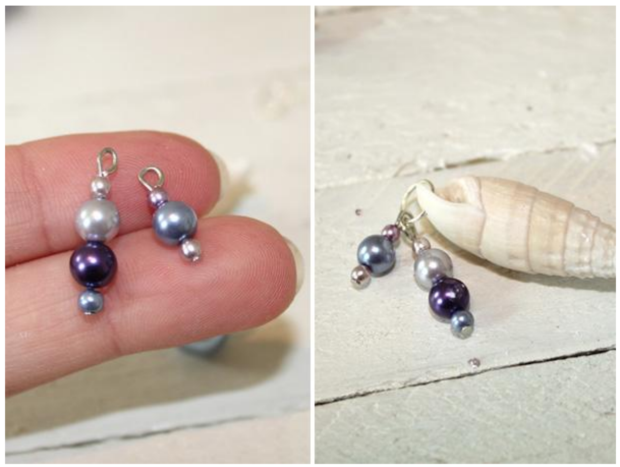
Have fun making your own shell jewelry!