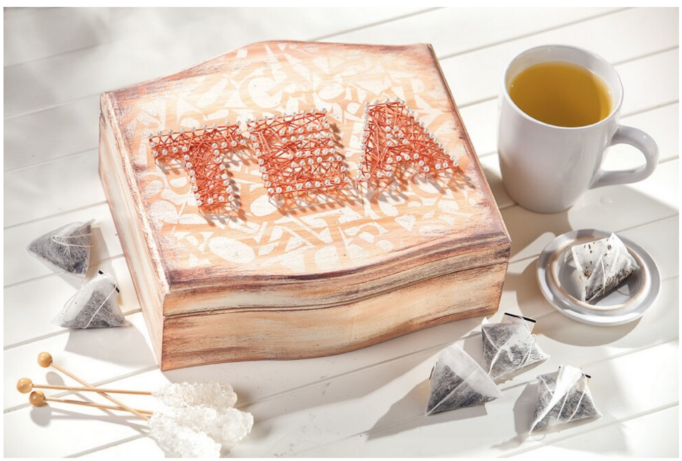
Here's how it works

With this beautiful tea box you can see immediately what is in it. The word "TEA" is placed over the stencilled motif with a large thread tension graphic - with simply Embroidery twist criss-crossing within the contours of the decorative-Needles.