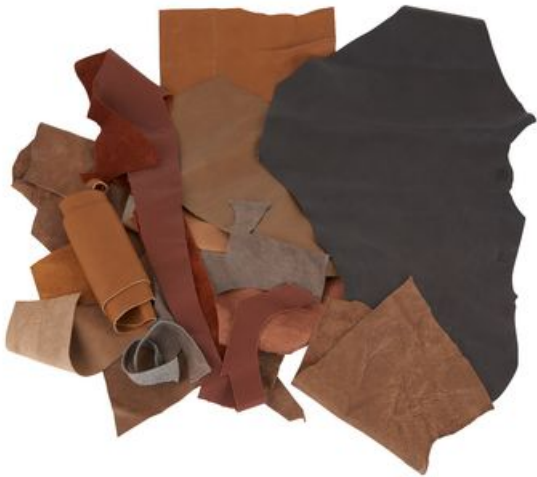
Leather residues, 1 kg