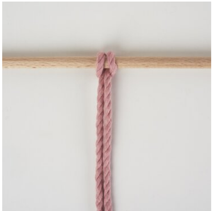
Lark's head knot backwards